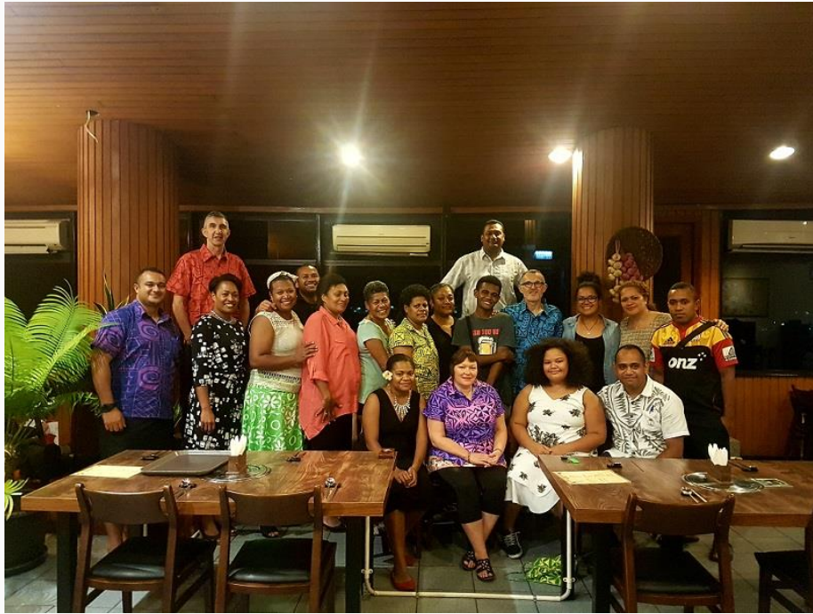
Fijian and New Zealand VMT clinicians all taking a well-earned break for dinner.